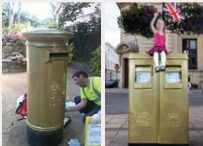
Painting the post box at Belton