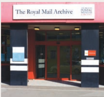
Current BPMA at Freeling House