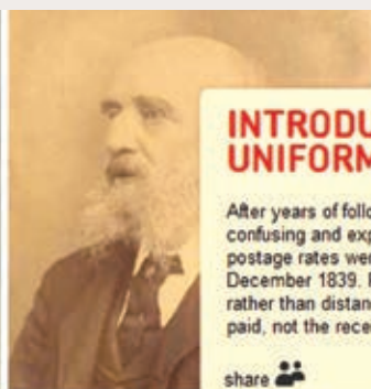
Photo of Edward Henry Corbould London, June 1889

The designers were contacted and all were enthusiastic to co-operate as the kudos of one's work appearing on stamps is renowned in the creative industries. Designers were chosen to represent the fashion eras on which they had put their stamp, from the elegance of the 1940s and Hardy Amies; to the swinging London of late 60s (Ossie Clark); seventies chic (Jean Muir); eighties theatricality (Zandra Rhodes); to nineties iconoclasm (Vivienne