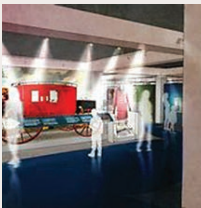
Artist impression of display cabinet for new museum

In our 2011/12 report RMG, which then included POL, set out six aims for heritage: