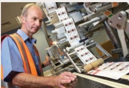
Olympic stamp print run