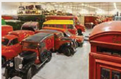
Collection of vehicles at Debden museum

Founded in 2004, the BPMA is the leading resource for all aspects of Britain's postal heritage. The BPMA manage and maintain the Royal Mail Archive, which also includes the written records of the GPO and The Post Office, and its museum collections.