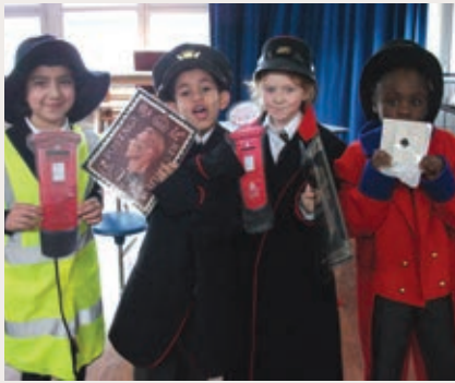
BPMA educational work