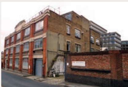
Calthorpe House today