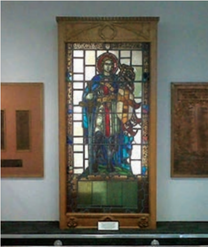
Memorial stained glass window