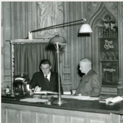
House of Commons Post Office