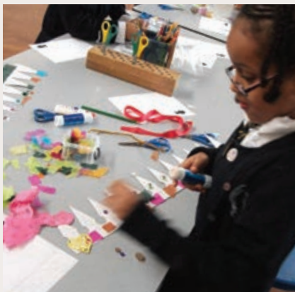
BPMA educational work

6.1 In 2012, RMG and POL each made the following payments to the BPMA as part of the on-going arrangements: