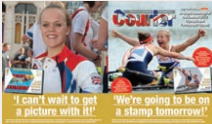
RMG Courier – staff magazine cover wrapper