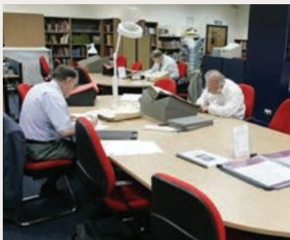
Search room at Freeling House