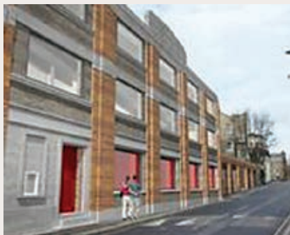
Calthorpe House in the future - artist impression