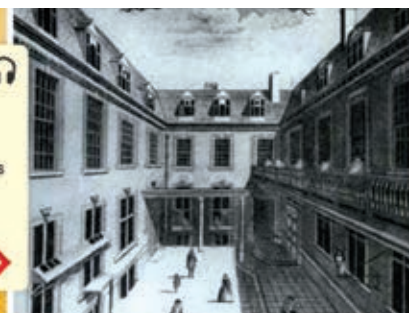
The inner courtyard of the General Post Office in what was once a grand villa in the City of London