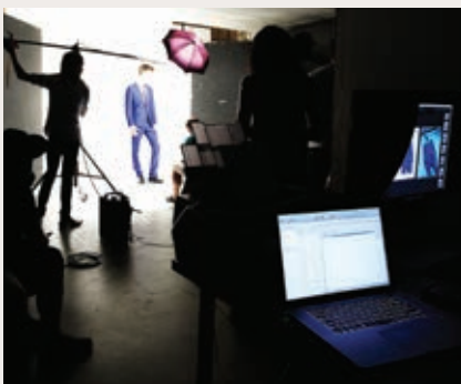
Sir Paul Smith fashion shoot

Westwood). Post 1970s menswear was to be featured too, and Sir Paul Smith was a fit because of his Savile Row pedigree and international reputation.