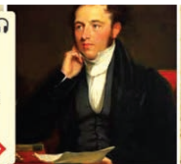
Portrait of social reformer Rowland Hill as a young man