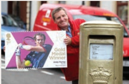
Gold post box Dunblane