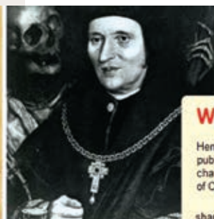
"Sir Brian Tuke & Death" by Hans Holcein the Younger