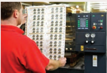
Olympic stamp print test