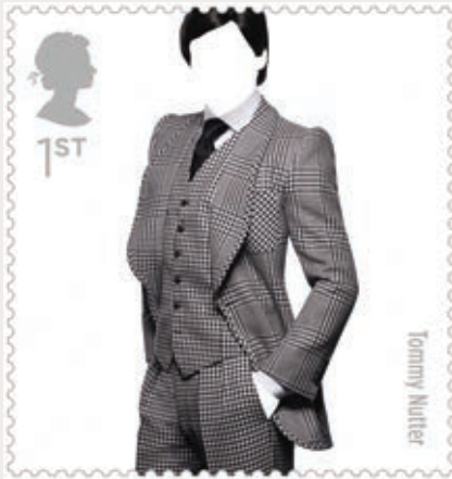
Tommy Nutter's suit for Ringo Starr