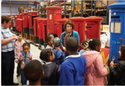
Children visit Debden museum