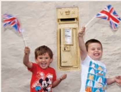
Restronguet gold post box