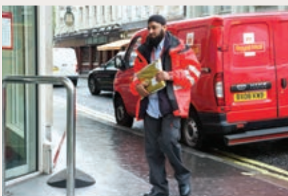
Olympic stamps being delivered to Post Office branches