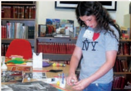
BPMA educational work