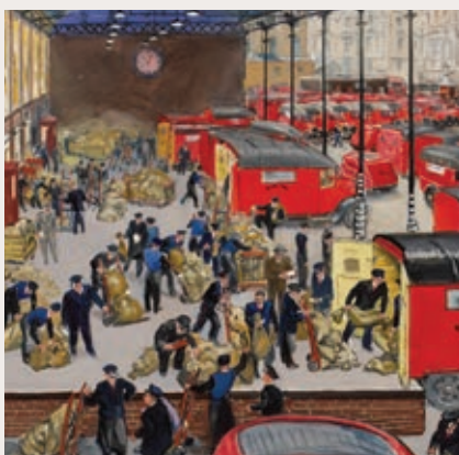
Mail workers at a main-line station

On 1 April 2012, following reforms contained in the Postal Service Act 2011, POL, the network of High Street and rural Post Offices, separated from RMG. This report describes the 12 month period from 1 April 2012 until 31 March 2013.