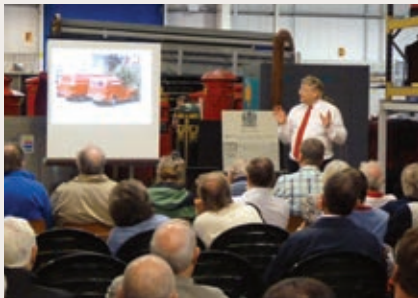
BPMA education and out-reach is available for all age groups

place of deposit appointment of the BPMA until the completion of the new archive, provided that the structure does not deteriorate substantially. TNA stated in the appointment letter: