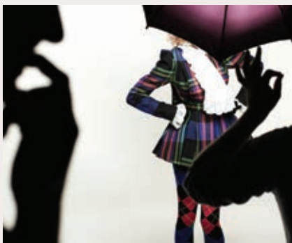
Vivienne Westwood fashion shoot