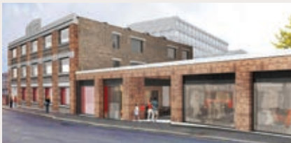
Artist's impression of the new BPMA

The new permanent home, which Britain's postal heritage needs, has come much closer in the past year. Following the grant of planning permission for a new home for the British Postal Museum & Archive (BPMA) at Calthorpe House, London, in the summer of 2012, the Heritage Lottery Fund backed the project in October with a development grant of up to £250,000 together with a chance to bid for £4million capital funding to complete the project. Royal Mail Group (RMG) has supported the BPMA's fundraising campaign aimed at meeting the shortfall during the year, and as a patron of the BPMA I have attended and spoken at events and encouraged potential corporate and individual donors to consider sponsorship and charitable giving.